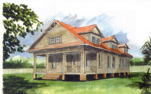
Boarding House