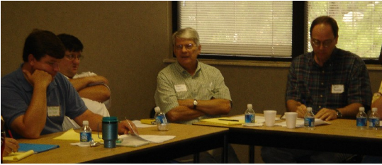
From August 27th Science Roundtable at the Coastal Georgia Center: