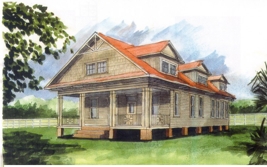
Boarding House rendering courtesy of Poticny Deering Felder PC

The Raymond M. Cash Foundation has issued the Ossabaw Island Foundation a $125,000 challenge grant for the rehabilitation of the