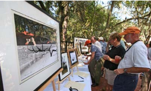
Potential bidders peruse the wide selection of art

Mark your calendars now! Next year's Pig Roast and Art Auction Saturday, October 21, 2006