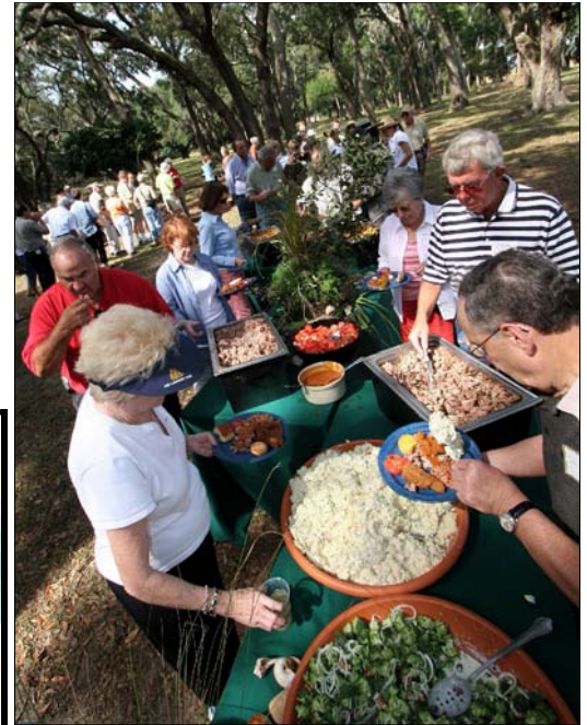
Delicious food is served