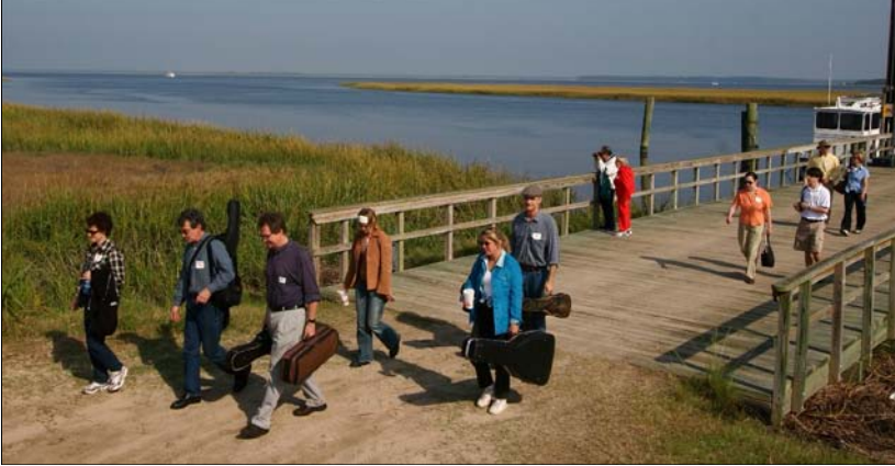
Guests arrive at the dock

Mark your calendars now! Next year's Pig Roast and Art Auction Saturday, October 21, 2006