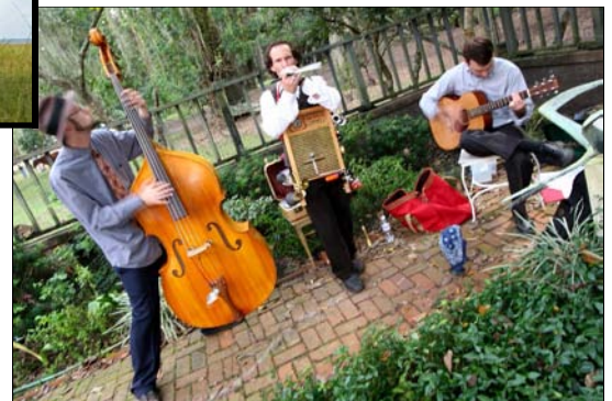
The Wiyos in the courtyard